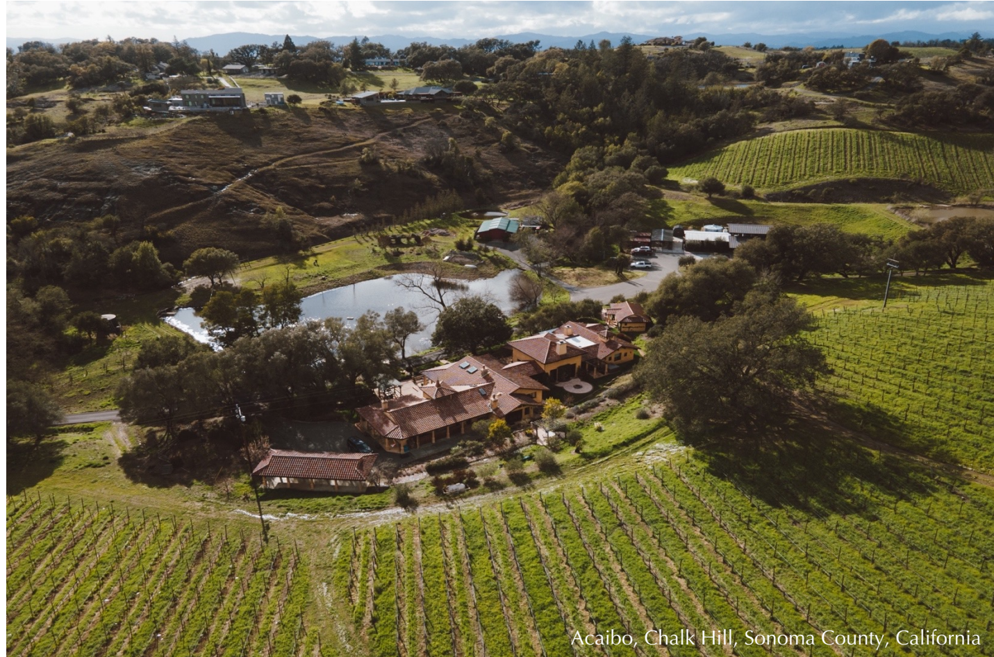
Acaibo, Chalk Hill, Sonoma County, California