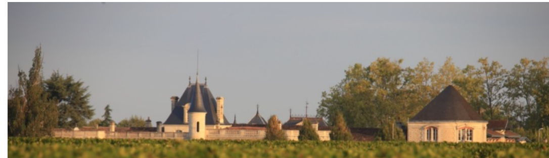
Château Durfort-Vivens, Margaux