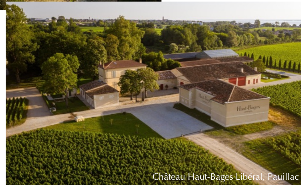
Château Haut-Bages Libéral, Pauillac