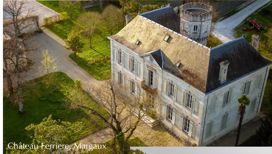
Château Ferrière, Margaux